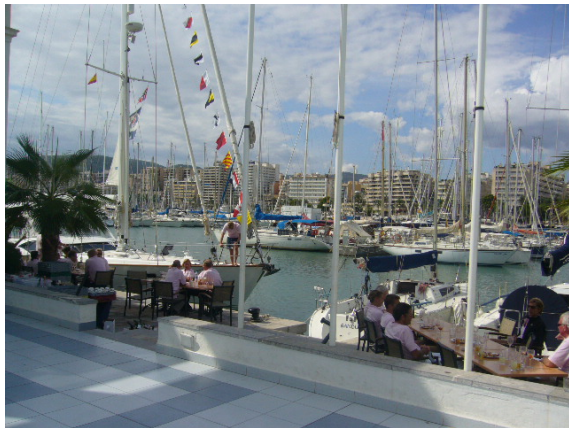
View from the RCNP