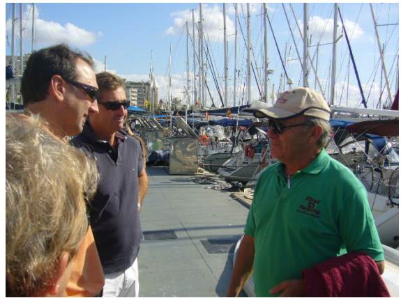
Meeting Charter Company Representatives