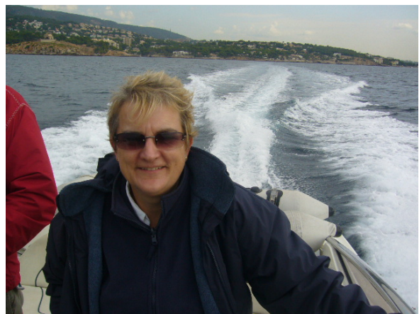
Exploring the west from Andraitx...