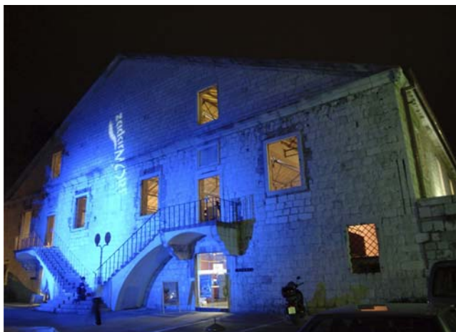
Arsenal Zadar, one of the locations for the evening events

In case you need further information or assistance please contact Wolfgang or me.