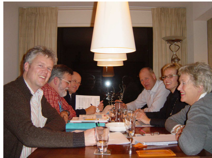
Commodores Organisation Team ECC 2008

To everyone who booked hotels and transfers with Adriatic Holidays: